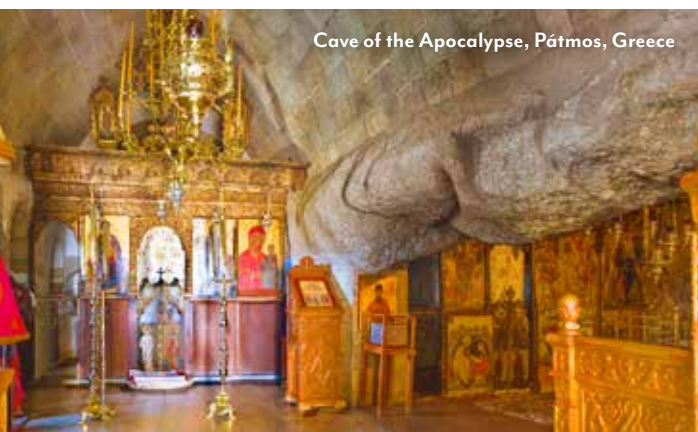
Cave of the Apocalypse, Pátmos, Greece

Explore the medieval old town as it was built by the Order of St. John, which occupied Rhodes from the early 14th century through the 16th century.