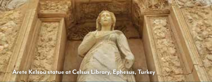
Arete Kelsou statue at Celsus Library, Ephesus, Turkey