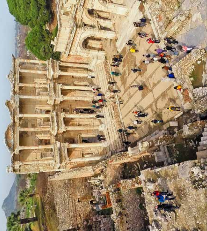
Celsus Library, Ephesus, Turkey

Early Booking Savings* available | Save $2,000 per couple!