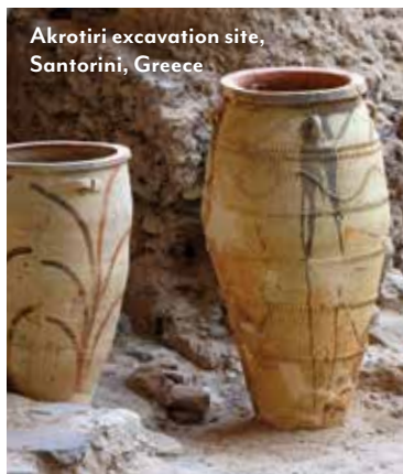
Akrotiri excavation site, Santorini, Greece