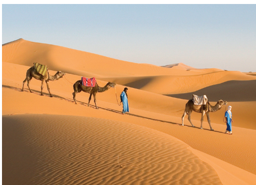
We ride camels in the Sahara on Day 8.

historical gate of Marrakech, Bab Agnaou, built in the 12 th century. Dinner tonight is at a local restaurant in the city’s Old Town. B,D