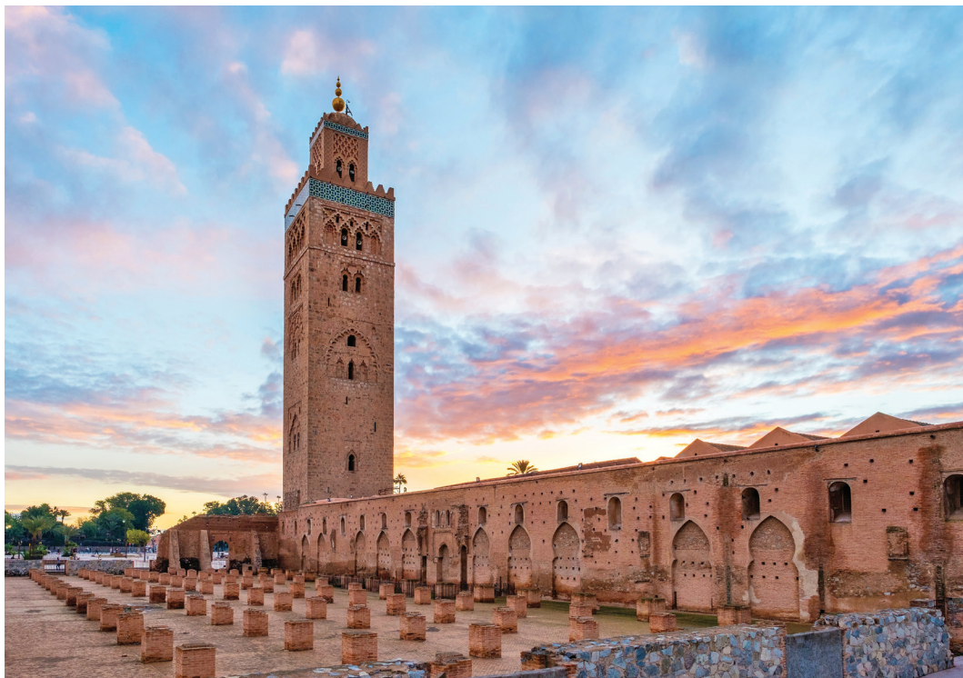
We see the distinctive Koutoubia Mosque – Marrakech’s largest – on Day 11.

Day 6: Fez Today we tour the old Mellab (Jewish quarter) and its 17 th -century synagogue and the royal gates. Then we walk through the Fez medina , where we see some hidden treasures, including the Blue Gate, the most picturesque of the Old City’s historic gates; the medieval school of Bouanania; the 12 th -century home of Jewish scholar Maimonides; and the authentic food market. The remainder of the afternoon is free for independent exploration and lunch on our own. B,D