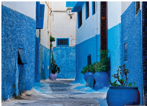
Rabat’s Kasbah des Oudaias

Day 12: Marrakech Our day-long tour includes the beautifully proportioned Koutoubia Mosque with its distinctive 282-foot minaret visible from miles away; Dar El Bacha Museum, a landmark 18 th -century palace housing a prized collection of Moroccan crafts and artifacts; and the recently restored 16 th -century Madrasa Ben Youssef in the heart of the medina , known especially for its splendid architecture. On the way back to the hotel, we stop to see the oldest