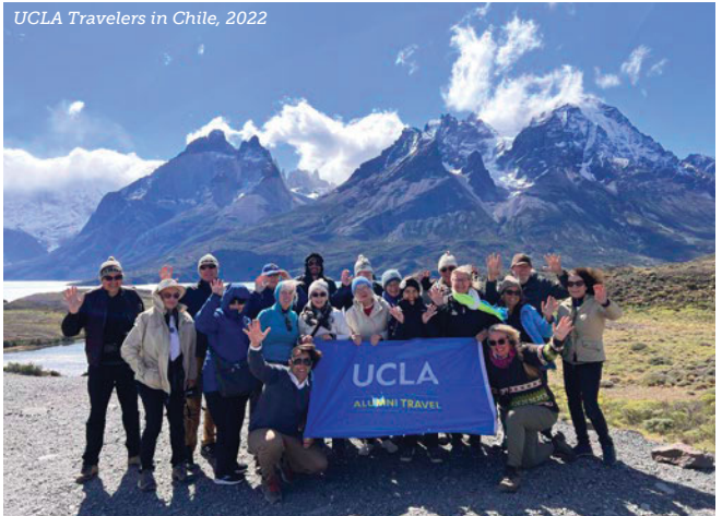
UCLA Travelers in Chile, 2022