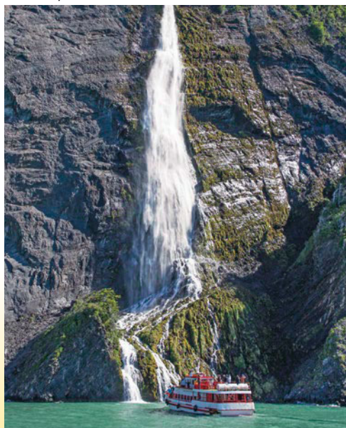
Ultima Esperanza Sound near Puerto Natales

Take a break mid-tour for lunch at Lago Gray,