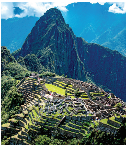
We explore the amazing ruins at Machu Picchu on Days 5 & 6.

Day 15: Quito/Depart for U.S. This morning we visit Quito’s Botanical Gardens, featuring an orchidarium with more than 1,200 species of orchids; and Iaquito Market, a colorful riot of fresh produce and