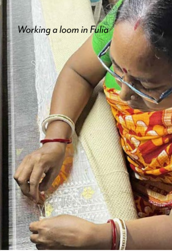
Working a loom in Fulia