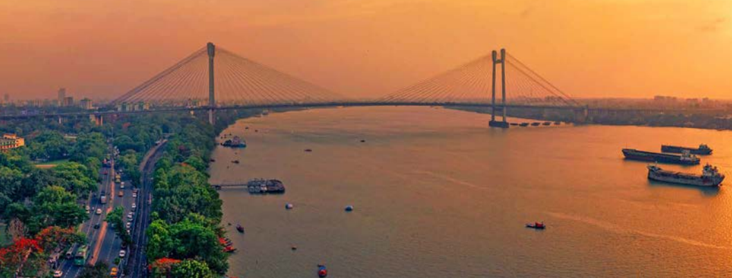
The Vidyasagar Setu bridge, also known as the Second Hooghly bridge, Kolkata

Visit the Hooghly Imambara Pilgrimage Center, a Shia Muslim mosque and congregation hall featuring a mix of architectural styles. After lunch on board, hop on an eco-friendly e-rickshaw this