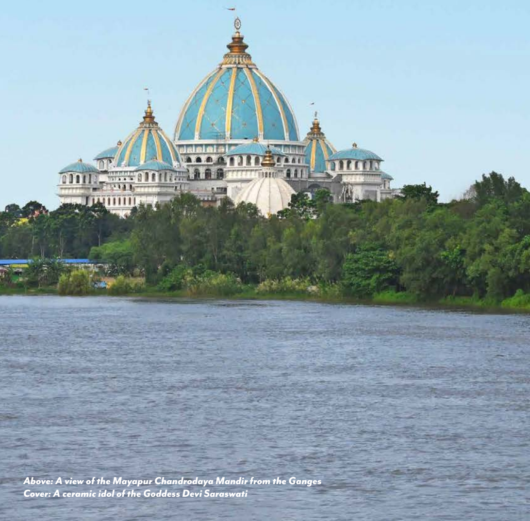
Above: A view of the Mayapur Chandrodaya Mandir from the Ganges Cover: A ceramic idol of the Goddess Devi Saraswati