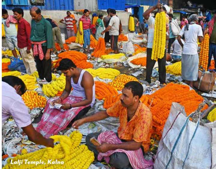
Lalji Temple, Kalna