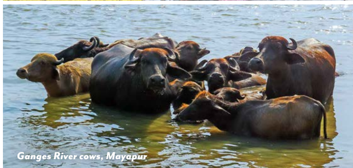
Ganges River cows, Mayapur