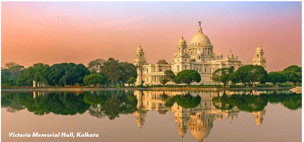
Victoria Memorial Hall, Kolkata

To secure your spot, call UCLA Alumni Travel at 310-206-0613 or visit alumni.ucla.edu/travel