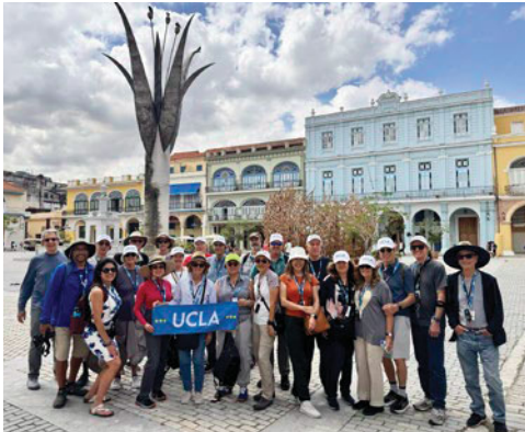
UCLA travelers in Cuba, 2025