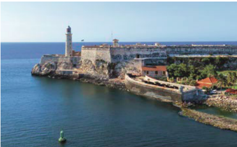
La Cabaña fortress, Havana harbor