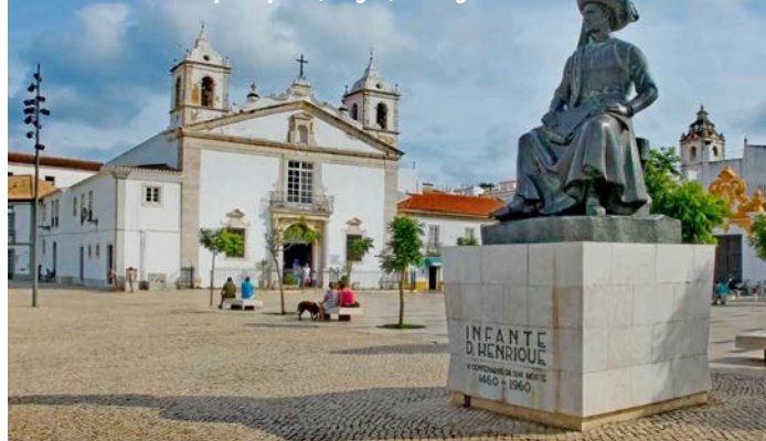
Infante Dom Henrique Square, Lagos, Portugal

After lunch on the ship, venture off to visit the Rock of Gibraltar, considered by the ancient Greeks and Romans to be one of the two Pillars of Hercules that marked the