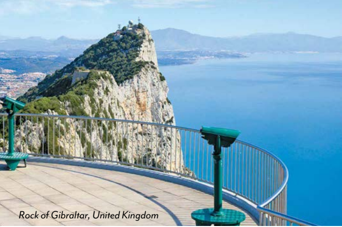
Rock of Gibraltar, United Kingdom