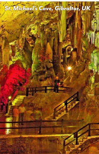
St. Michael's Cave, Gibraltar, UK

Join fellow passengers for a Captain’s Farewell Reception.