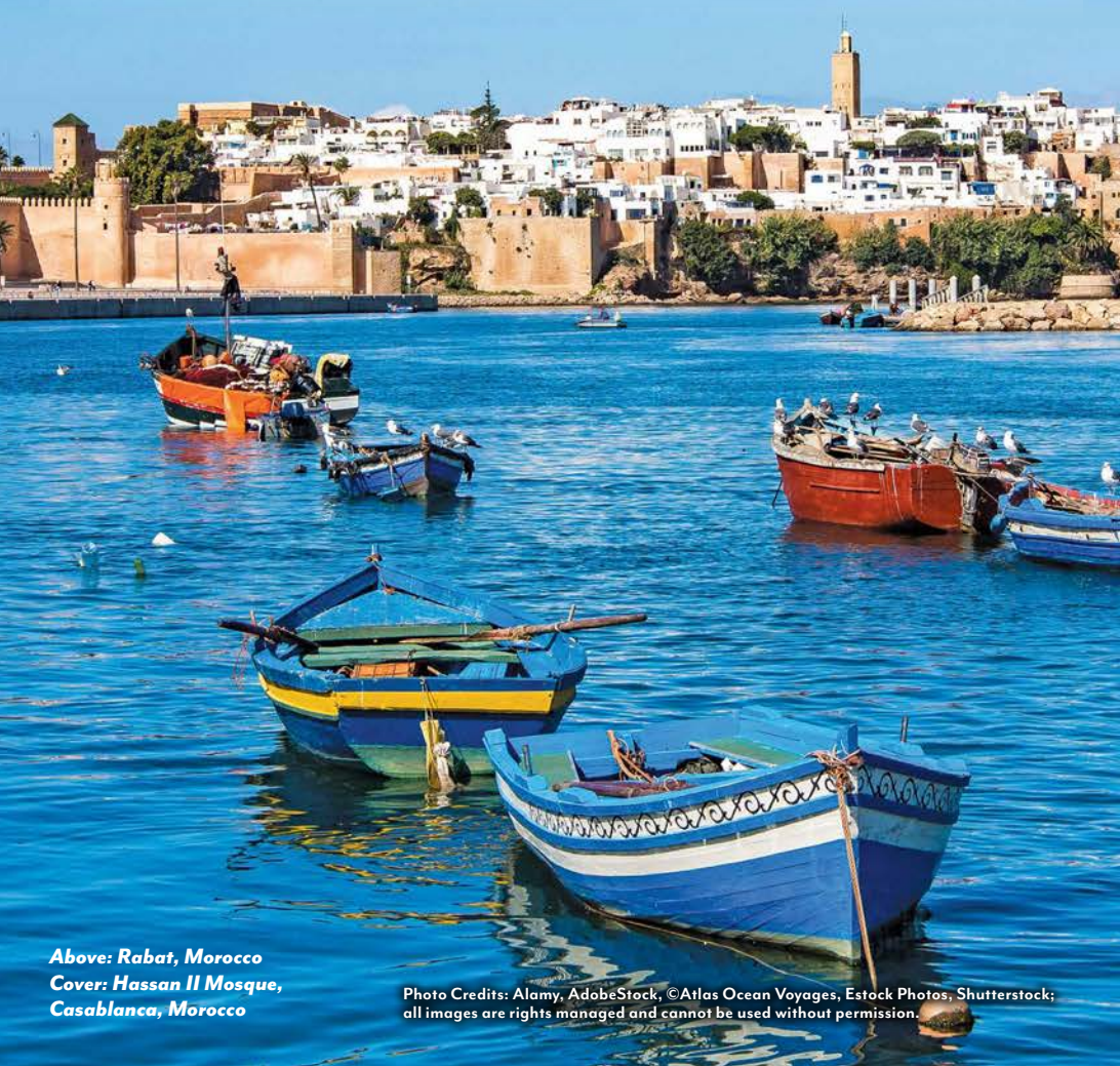
Above: Rabat, Morocco Cover: Hassan II Mosque, Casablanca, Morocco

Photo Credits: Alamy, AdobeStock, ©Atlas Ocean Voyages, Estock Photos, Shutterstock; all images are rights managed and cannot be used without permission.