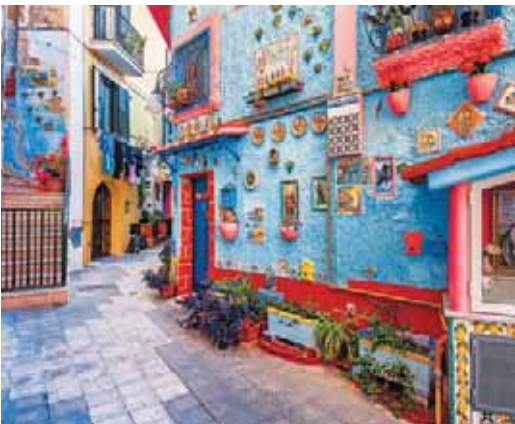
Colorful alleyways of Vietri sul Mare

Enrichment: The Horror and Splendor of Mount Vesuvius. Learn about the tragic effects of the eruption of Mount Vesuvius. This compelling talk provides context for tomorrow's visit to Herculaneum and Pompeii.