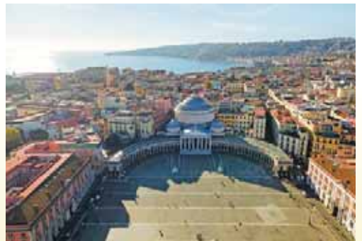
Piazza del Plebiscito, Naples

Naples & the Museo Archeologico Nazionale. Energetic Naples, the capital city of Campania, welcomes visitors with a vivacious spirit. Gain insight into the ancient world at the Museo Archeologico Nazionale. The museum's galleries boast one of the largest collections of Greco-Roman artifacts in the world. Continue on a panoramic tour of Naples, taking in sprawling views of the city and the Bay of Naples from atop Posillipo Hill. Note the landmarks of Castel Nuovo, San Francesco di Paola, Teatro di San Carlo and Piazza del Plebiscito.