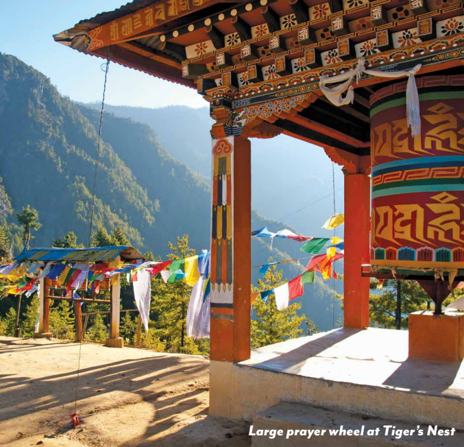
Large prayer wheel at Tiger's Nest