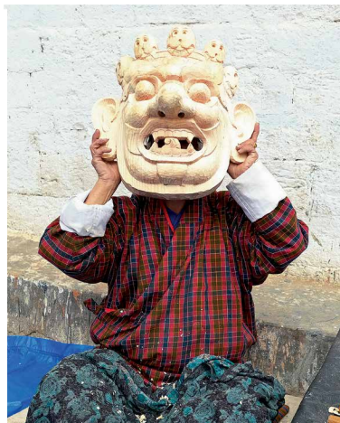
Craftsman showing his carving handiwork on a traditional dance mask

Note: This is an ACTIVE program. The itinerary is subject to change due to local conditions.