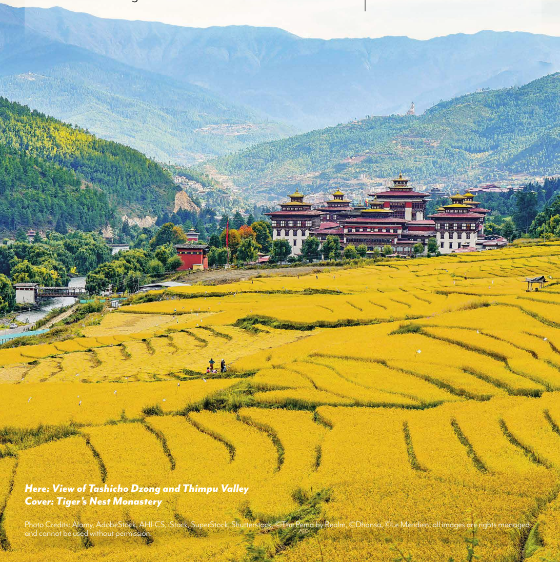
Here: View of Tashicho Dzong and Thimpu Valley Cover: Tiger's Nest Monastery