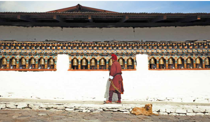
Prayer wheels at Kyichu Lhakhang

known as Tiger's Nest). This monastery, one of Bhutan's holiest destinations, is perched on a precipitous cliff above the Paro Valley, about 10,236 feet above sea level. Take in the gorgeous view of the lush Paro Valley and breathtaking Himalayan mountains. Or, visit Dzongdrakha, a string of cliff-side chapels and temples overlooking the valley. Immerse yourself in the beauty and tranquility of this less-visited site. Spend time exploring on your own this afternoon. Join your fellow travelers for a Farewell Reception and Dinner this evening.