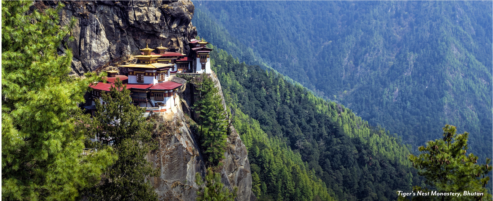
Tiger's Nest Monastery, Bhutan