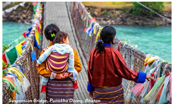
Suspension Bridge, Punakha Dzong, Bhutan

All Program Features are contingent upon final brochure pricing. 2026