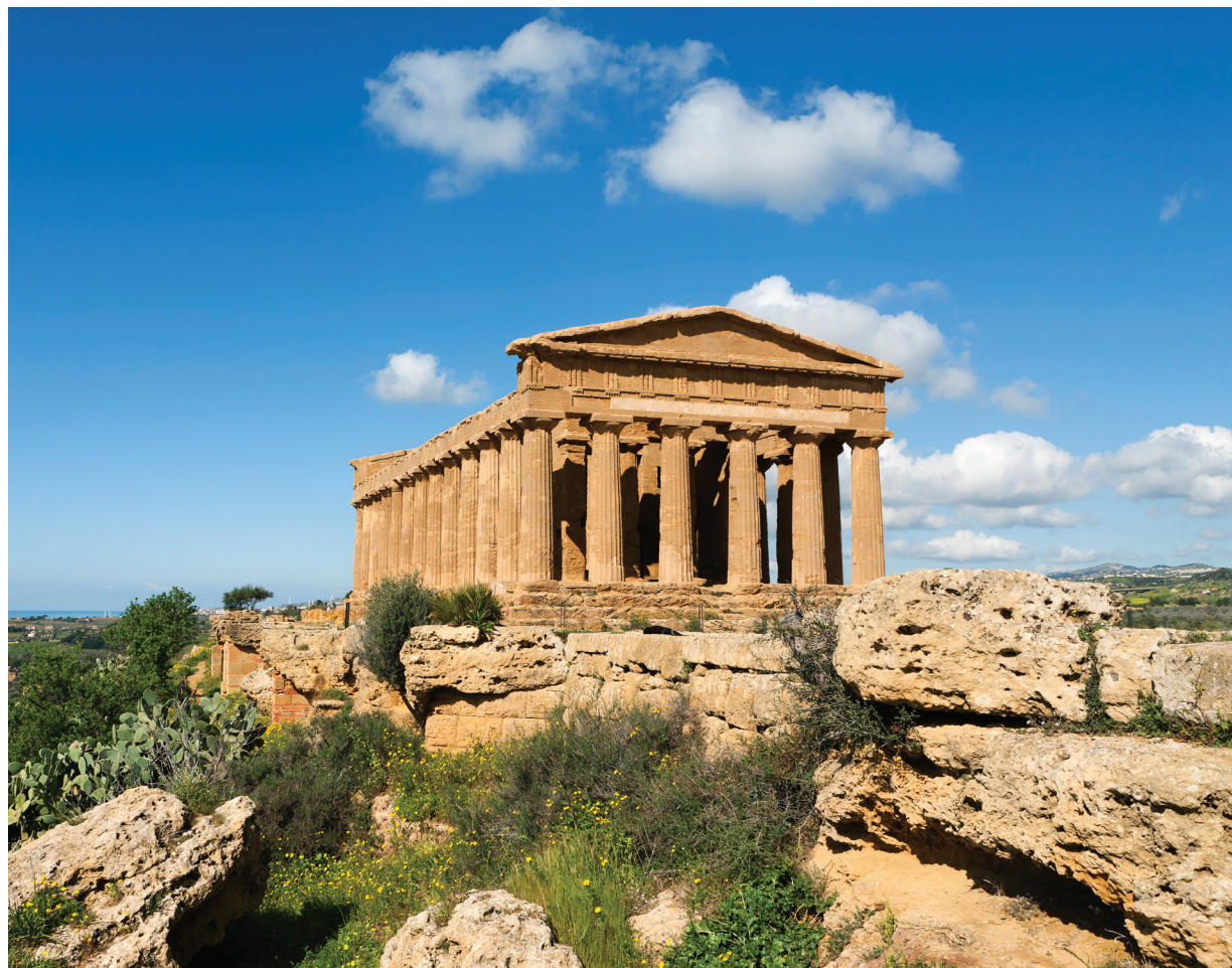
On Day 6, we explore the Valley of the Temples in hilltop Agrigento. Above: Temple of Concordia