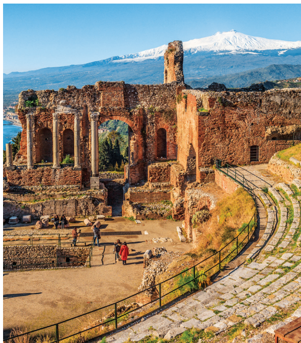
Taormina’s ancient theater overlooks Mt. Etna.

Day 6: Agrigento This morning we visit the Valley of the Temples, a UNESCO site and archaeological zone whose ruins of fallen Doric temples and sanctuaries date to Greek rule in the 5 th century BCE. Known in its heyday as “the most beautiful city of mortals,” Agrigento was one of the leading cities during the Golden Age of ancient Greece. Our tour features both the eastern zone, where we see the beautifully preserved Temple of Concordia (c. 430 BCE), and the western zone, with the massive temple of Olympian Zeus, believed to be the largest Doric temple ever built. From the outdoor sites, we then move on to Agrigento’s archaeological museum, with exhibits and artifacts that tell the story of this outpost of classical Greece. Then we have lunch at a local restaurant and an afternoon at leisure. This evening, we visit an organic working farm for a cooking demonstration and dinner. B,L,D