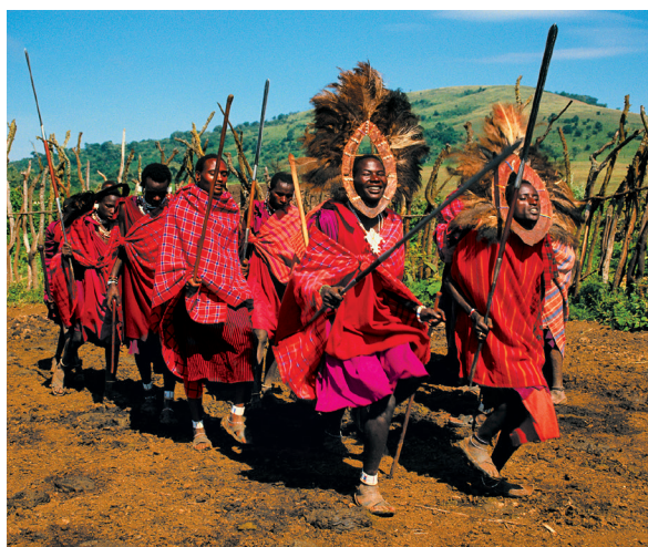
Kenya’s native Maasai people

Day 16: Arrive U.S. We reach the U.S. today and connect with our flights home.