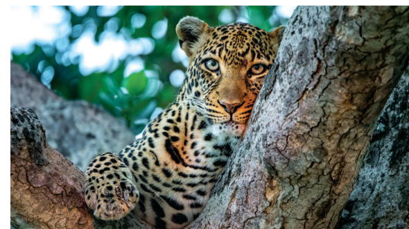
Leopard in the Serengeti