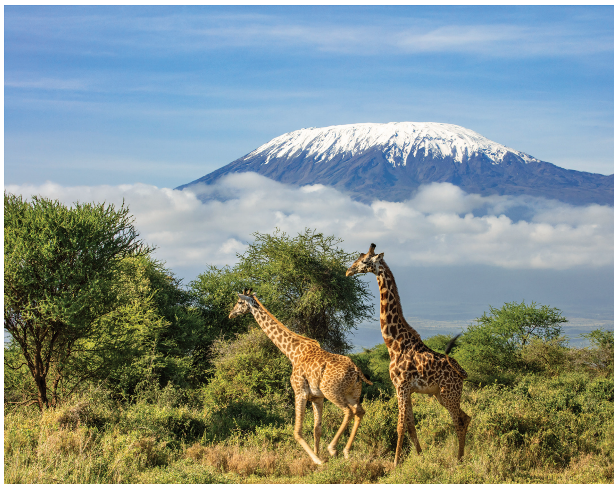
Giraffe roam Amboseli National Park in the shadow of Mt. Kilimanjaro.