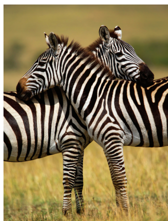
We’re sure to see zebra.

Day 11: Serengeti/Masai Mara We leave Tanzania today, crossing into Kenya and continuing on to Masai Mara by air. Kenya’s premier game reserve rich with animal life, the Mara is the traditional homeland of the Indigenous Maasai people. Known especially for the annual migration that sees some two million wildebeest, plus hundreds of thousands of other plains game migrate here from the Serengeti (Masai Mara being the continuation of the Serengeti in Kenya), the Mara sits in the Great Rift Valley and comprises 583 square miles of vast plains, acacia forests, grass-covered hills, and slow-flowing rivers. We arrive at our tented camp late this morning then have our first game drive here later this afternoon. B,L,D