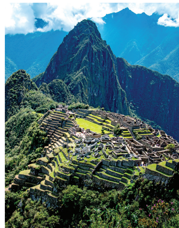
We explore the amazing ruins at Machu Picchu on Days 5 & 6.

transfer to the airport for our overnight flight to the U.S. B