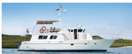
We stay in comfort for four nights in spacious rooms at the Royal Palm Galapagos, set in the lush highlands of Santa Cruz island, and enjoy day cruises aboard the Santa Fe, our privately chartered yacht.