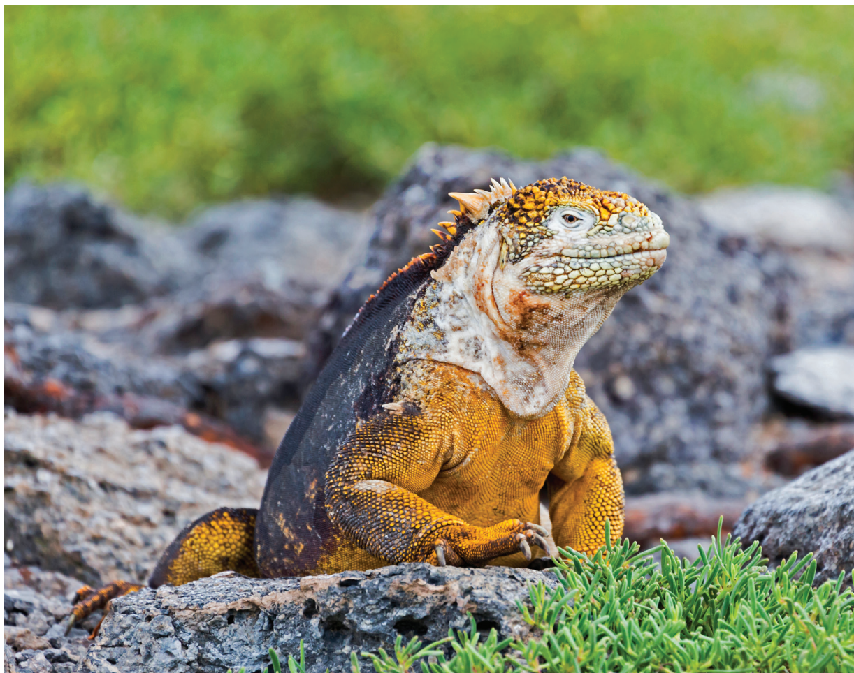
We'll encounter plenty of wildlife in the Galapagos, including relatives of this land iguana.

Ratings are based on the Hotel & Travel Index, the travel industry standard reference.