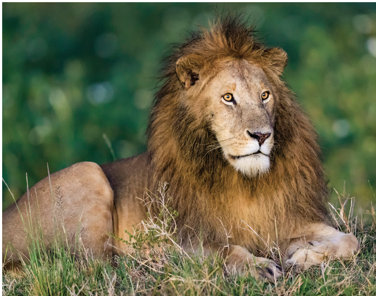
Leader of the pride: a male lion rests before his next hunt.