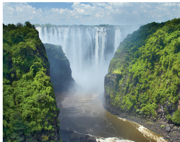
Victoria Falls, the “smoke that thunders”

Day 13: South Luangwa National Park/Lusaka/ Depart for U.S. We travel by light aircraft today