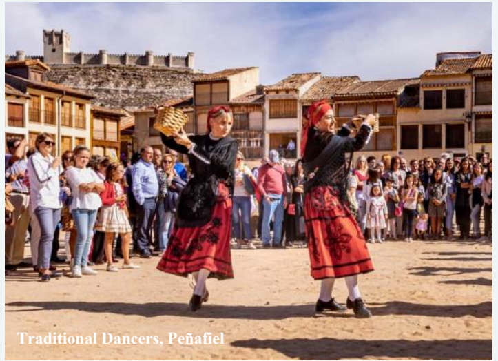
Traditional Dancers, Peñafiel

Spend the day exploring the Ribera del Duero region, which gets its name from the Duero River that runs throughout its vineyards, feeding its grapes every step of the way. The Spanish 'Ribera', means 'river bank', meaning that literally the name of this wine region is the river bank of the Duero