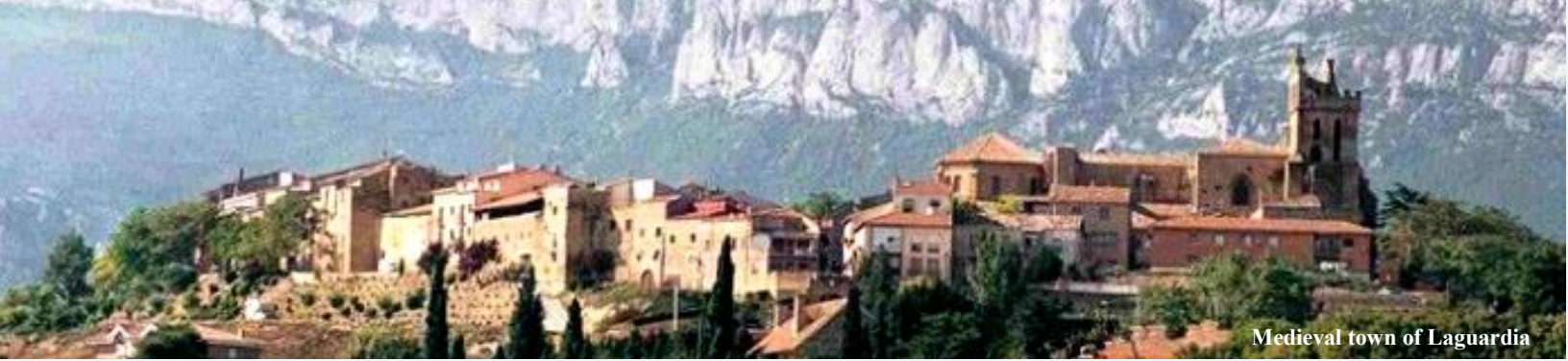
Medieval town of Laguardia

Enjoy a celebratory dinner this evening at a local restaurant after the solar eclipse viewing. B,L,D