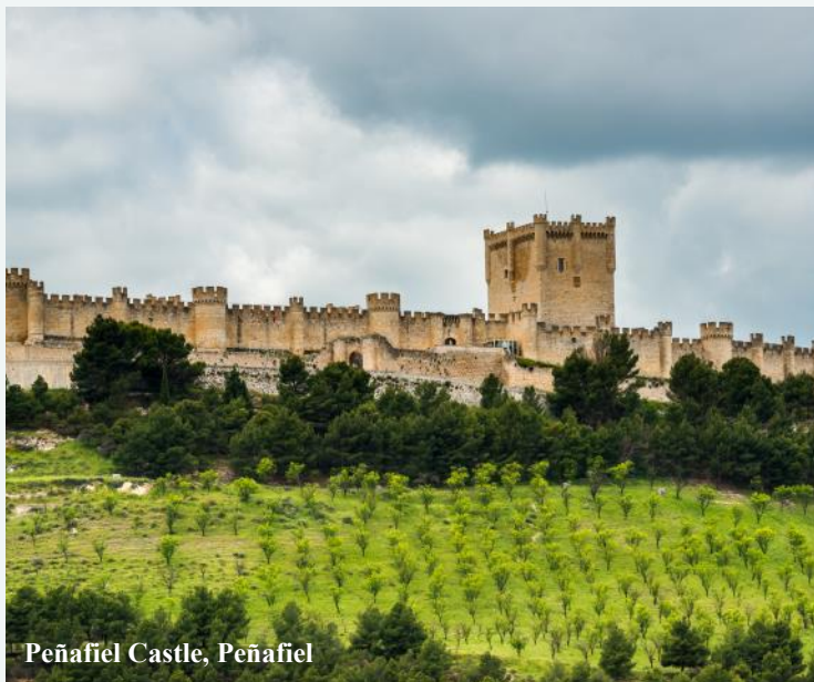
Peñafiel Castle, Peñafiel

Herschel. The building itself is crowned by Grubb's large equatorial telescope dating from 1912. Another particular highlight is the library, which conserves one of the most ancient and extensive collections of documents on astronomical subjects.