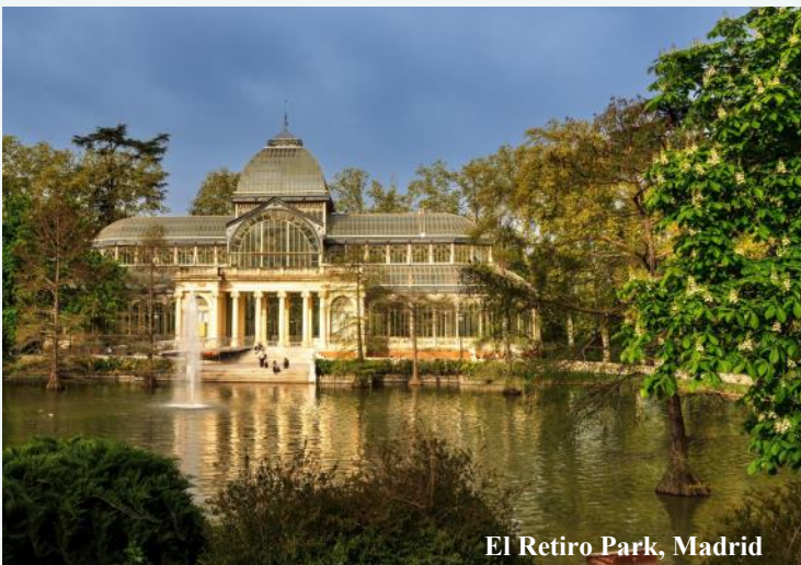
El Retiro Park, Madrid

After the first lecture by Professor Jean-Luc Margot, continue to the Retiro Park and the Villanueva Building to visit the Royal Observatory Museum which houses an important collection of antique instruments used for different purposes in astronomy and meteorology. The collection includes a meridian circle, a selection of precision timepieces and a bronze mirror polished by W. Herschel. A Foucault pendulum in the central rotunda illustrates the daily rotation of the earth. There is a reconstruction of the 25-foot reflecting telescope with a diameter of 24 inches designed for the observatory at the end of the 18th century by the famous astronomer, William