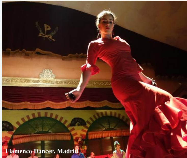
Flamenco Dancer, Madrid