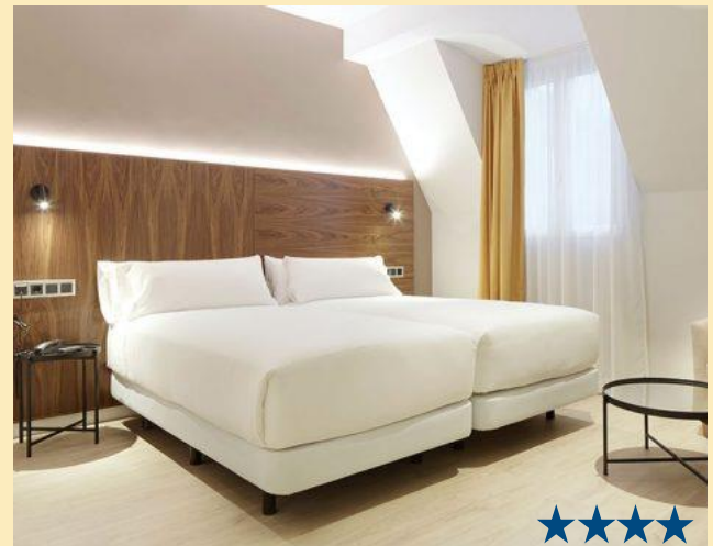
Hotel Arrizul Congress, San Sebastian