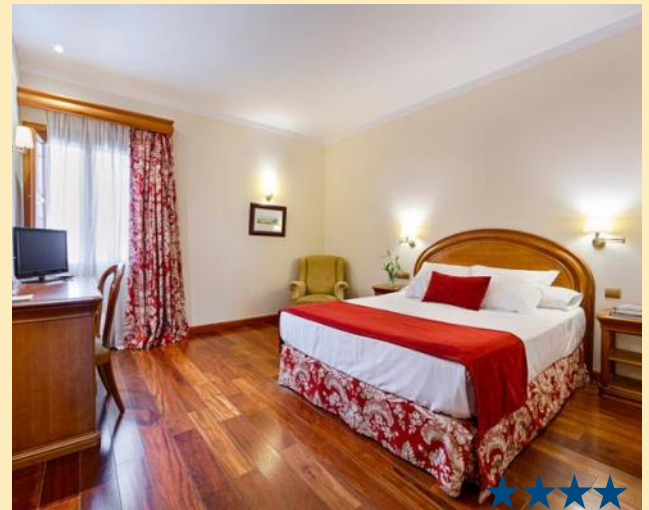
AZZ Peñafiel Las Claras Hotel & SPA, Peñafiel