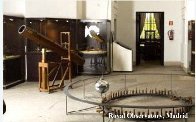
Royal Observatory, Madrid

his new capital. However, partly due to political turbulence and strong opposition by the powerful archdiocese of the then larger city Toledo, the construction was constantly postponed until 1879 and was finally finished in 1992.