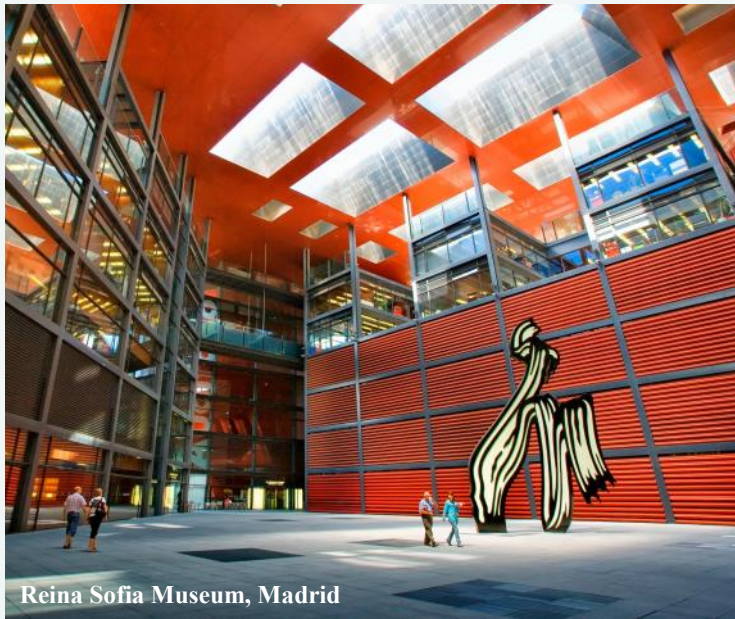
Reina Sofia Museum, Madrid