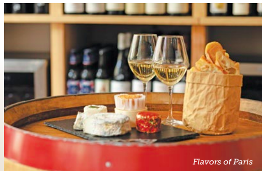
Flavors of Paris

Flavors of France. Step into the world of