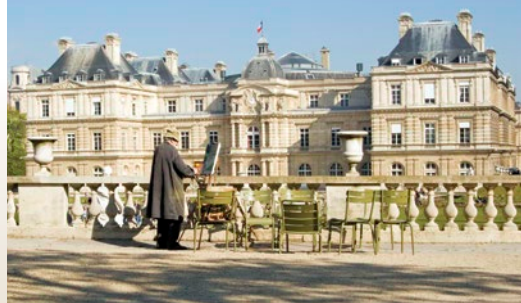
Luxembourg Gardens, Latin Quarter