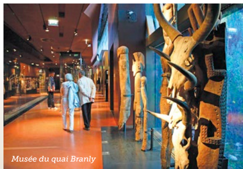
Musée du quai Branly

Enrichment: An African American Writer in Paris Today. Delight in a discussion with