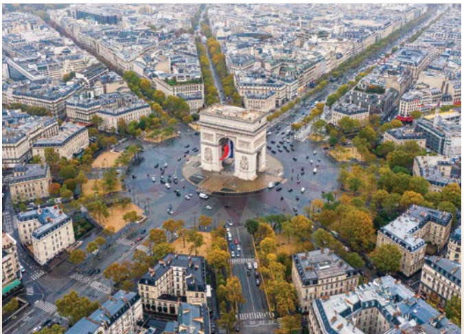
Arc de Triomphe and the Champs-Élysées

After World War I, Parisians rebuilt their lives as jazz, a new sound introduced to France by African American soldiers, filled the air. Lively and unique, jazz was the perfect soundtrack to a fresh start, both for French music fans and African American troops. The 369th Infantry Regiment is credited with transforming Paris' cultural scene. The unit became famous for its bravery and its band, led by Lieutenant James Reese Europe and Sergeant Noble Sissle. Attached to the French army because U.S. forces were still segregated, the 369th Infantry was brave in battle. Nicknamed the "Harlem Hellfighters" by the Germans, the 369th and several individual soldiers were singled out for France's highest award for valor. Off the battlefield, the band boosted morale across France with music that would soon fill Parisian clubs. For two decades, Montmartre hosted the flourishing jazz community, which drew African American musicians and club owners from the U.S. Several musicians left Paris during Germany's World War II occupation, but the city's love of jazz never wavered. Jazz surged again after the war with great African American musicians leading the way, and the music still delights concertgoers today.