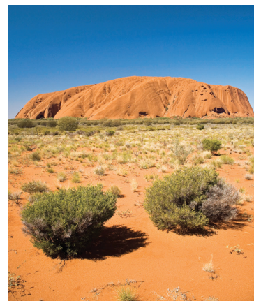
Aboriginal site of Uluru (Ayers Rock)

Day 14: Mount Cook This morning's tour of alpine Mount Cook Village includes a visit to the Sir Edmund Hillary Alpine Center, where we see a 3D