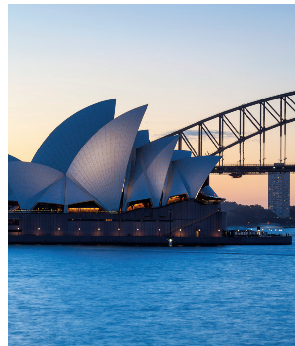
Sydney's signature Opera House and Harbour Bridge

the War Memorial Museum, with its prized Maori and Pacific Islander collections. Tonight we enjoy a farewell dinner at our hotel. B,D