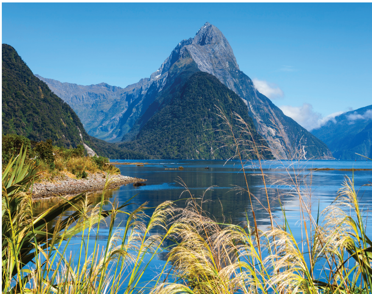
On Day 16, we cruise on Milford Sound surrounded by towering peaks, waterfalls, and rainforests.