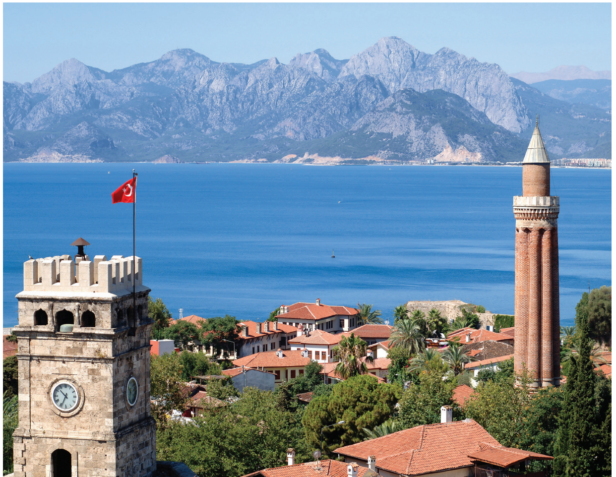
An Antalya landmark, the Yivli Minare (fluted minaret) overlooks the Turquoise Coast.

Fascinating sights, scents, and sounds reign in this land where Europe and Asia meet. From Istanbul, magnificent “Empress of the World,” to ancient ruins, stunning landscapes, and the dramatic – and legendary – Turquoise Coast, Türkiye engages and beguiles, offering us an unparalleled small group experience.