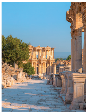
Celsus Library, Ephesus

Day 9: Kusadasi/Ephesus We return to Ephesus to visit the Basilica of St. John, the 6 th -century ruins that stand over what is believed to be the burial site of John the Apostle. Then we learn about Ephesus