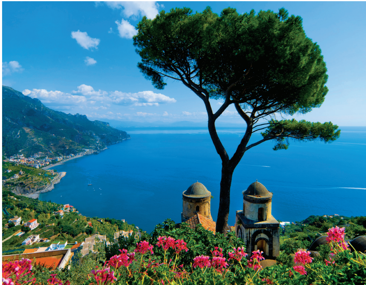
Listed as a UNESCO site, the Amalfi Coast boasts colorful villages and stunning scenery overlooking the Tyrrhenian Sea.

Ratings are based on the Hotel & Travel Index, the travel industry standard reference.