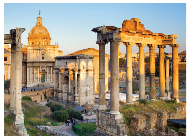
We tour Rome's Forum on Day 6.