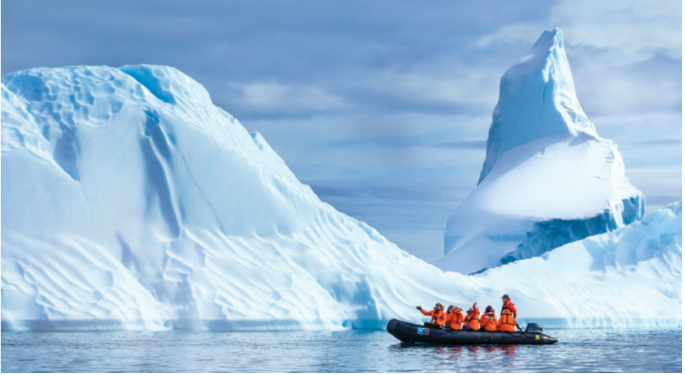
Guests exploring by Zodiac in Antarctica.

embark on a Zodiac excursion in search of seals and blue-eyed shags; or walk amid thousands of Adélie and gentoo penguins. The next, you might experience the thrill of the ship crunching through pack ice. In Antarctica, opportunities abound to capture uniquely beautiful images. Along the way your expert expedition team will enrich every experience. (B,L,D)