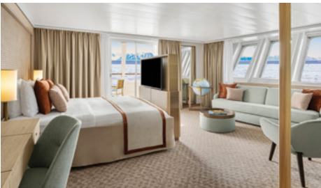
Category 7 suite with balcony.

All cabins and suites face outside with windows or portholes, and have a private bathroom and climate controls. Equipped with Wi-Fi, multiple electrical outlets, USB outlets, full-length mirror and phones.