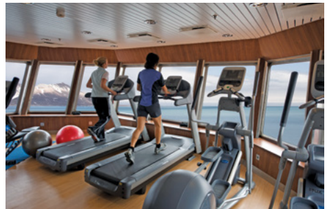
Fitness center with panoramic views.

Every staff member is committed to ensuring guests have an unforgettable experience. Many of the veteran guides and naturalists are locally based in your destination and have worked with the company for decades. A full-time medical professional, undersea specialist, National Geographic photographer and a certified photo instructor are on board, and with a high staff-to-guest ratio, you can hear different perspectives and gain new insights every day.