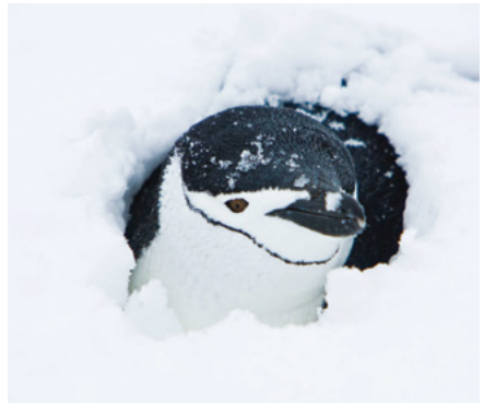
A chinstrap penguin burrowed in the snow.

Discover Chilean Patagonia's crown jewel, Torres del Paine National Park, on a 5-day pre-voyage extension that immerses you in this incredible UNESCO biosphere reserve. Spend time among the park's picturesque glaciers, forests, peaks and grasslands as you enjoy walks, hikes, birding and horseback riding in one of the most wildlife-rich areas in the Americas. In between active adventures, relax in a premier lodge located in the heart of this expansive park.