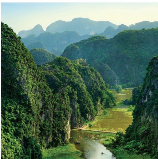
We spend two days amid the stunning landscape of Ninh Binh.

followed by a walking tour of the Talat Noi district, one of Bangkok’s oldest neighborhoods and now an emerging cultural hub. Tonight we celebrate our Southeast Asia odyssey at a farewell dinner. B,D