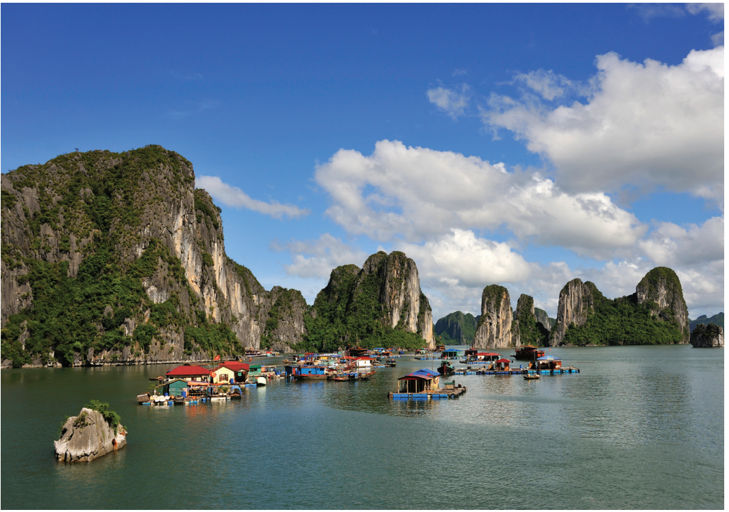
We visit the World Heritage site of Ha Long Bay on Day 4.

Thom, site of Bayon Temple, an imposing stone edifice of 54 towers each carved with four enigmatic faces. B,L