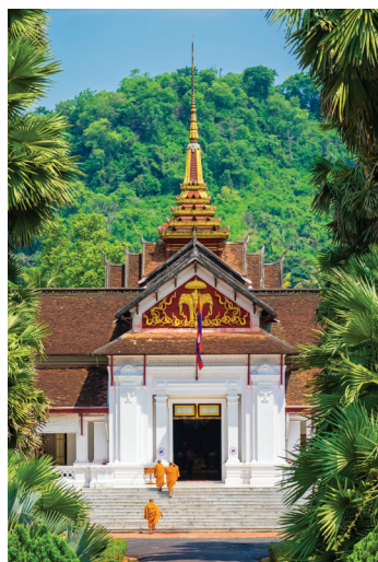
National Museum, Luang Prabang

Day 15: Chiang Mai A tour highlight is in store today as we visit an elephant sanctuary, where we encounter these peaceful giants in their natural habitat. We have the opportunity to don the traditional garb of the mabout (elephant keeper), prepare food for the animals, and accompany them to a pond for bath time. B,L,D