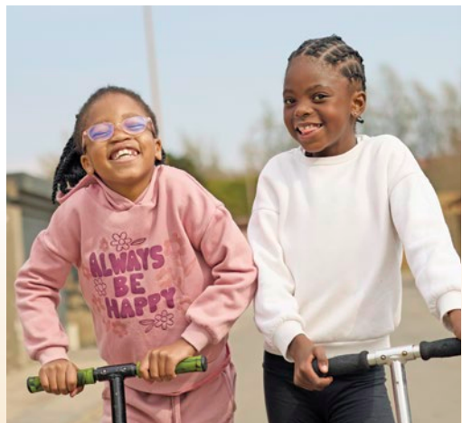
Youth program in Soweto