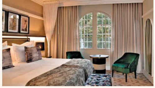
Mount Nelson, A Belmond Hotel | Cape Town