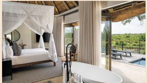
Leopard Sands, Kruger Park | Adjacent to Kruger National Park