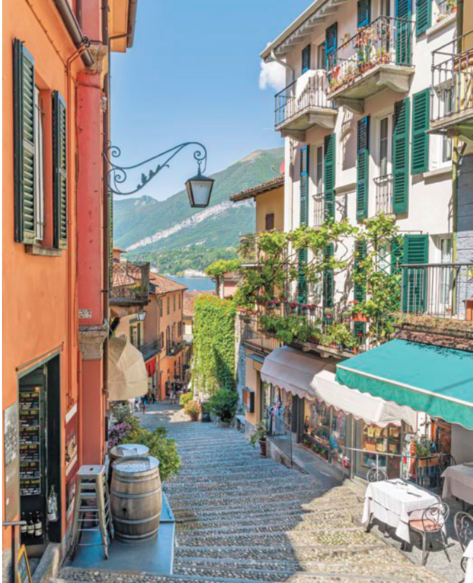
Cobblestone alley leading to the waterfront in Bellagio