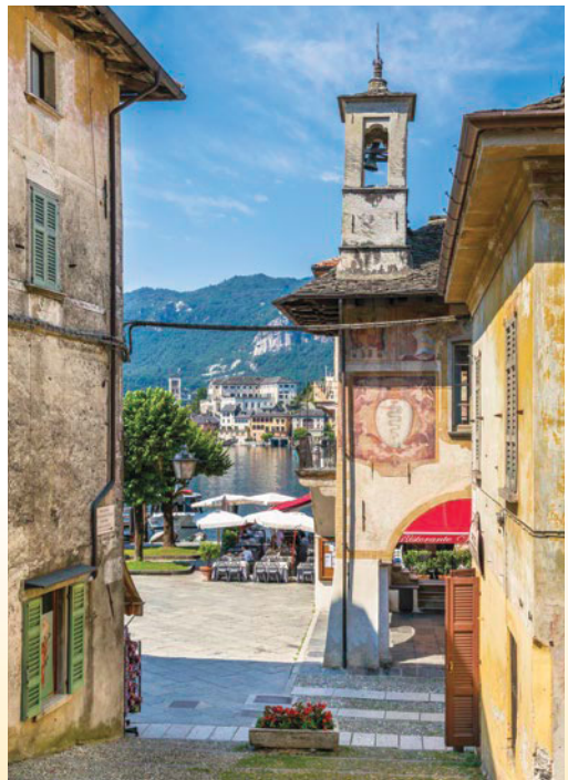
Orta San Giulio