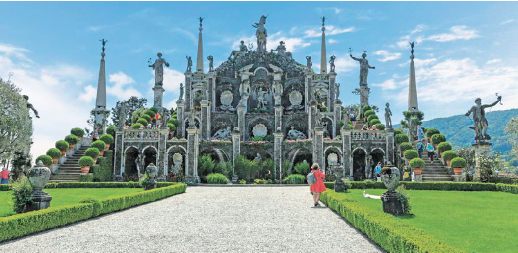
Gardens of Isola Bella

Free Time: Discover the magic of Bellagio and savor lunch on your own.