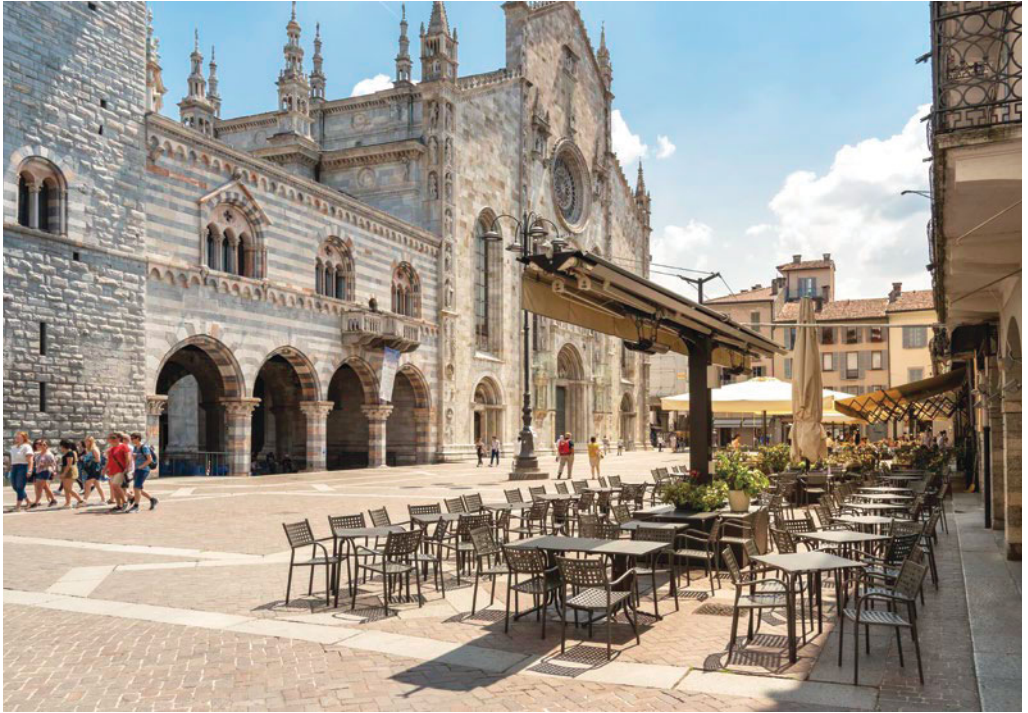
Historic center of Como