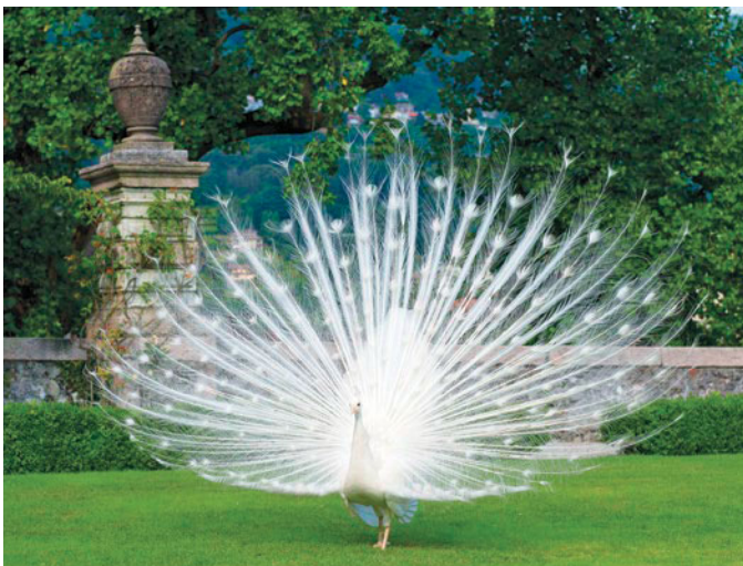
Above: White peacock, Isola Bella | Below: Isola dei Pescatori