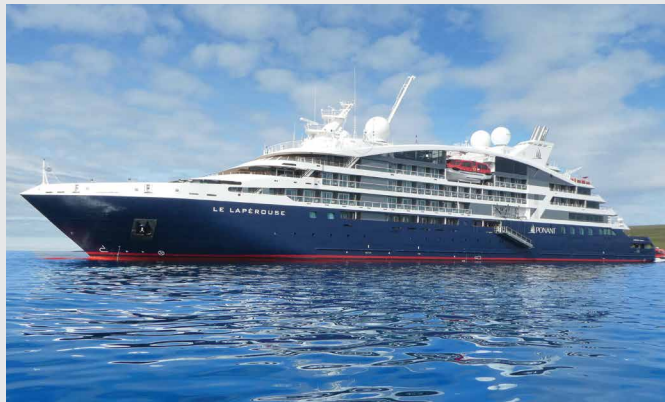
Le Laperouse Exclusively Chartered, Deluxe Small Ship