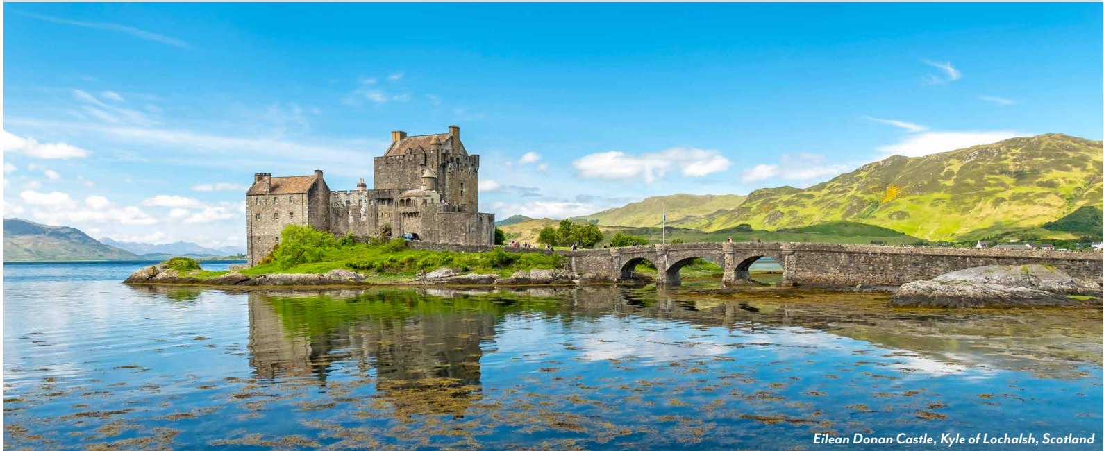
Eilean Donan Castle, Kyle of Lochalsh, Scotland