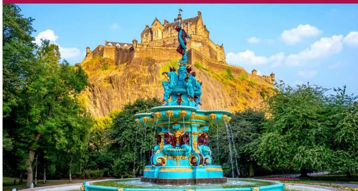
Glasgow and Edinburgh | 4 days, 3 nights May 10 to 13, 2027 | Program Ends: May 13

All Program Features are contingent upon final brochure pricing. 2027