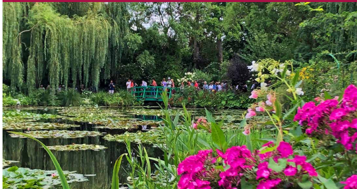
Paris and Giverny | 4 days, 3 nights April 29 to May 2, 2027 | Program Begins: April 30