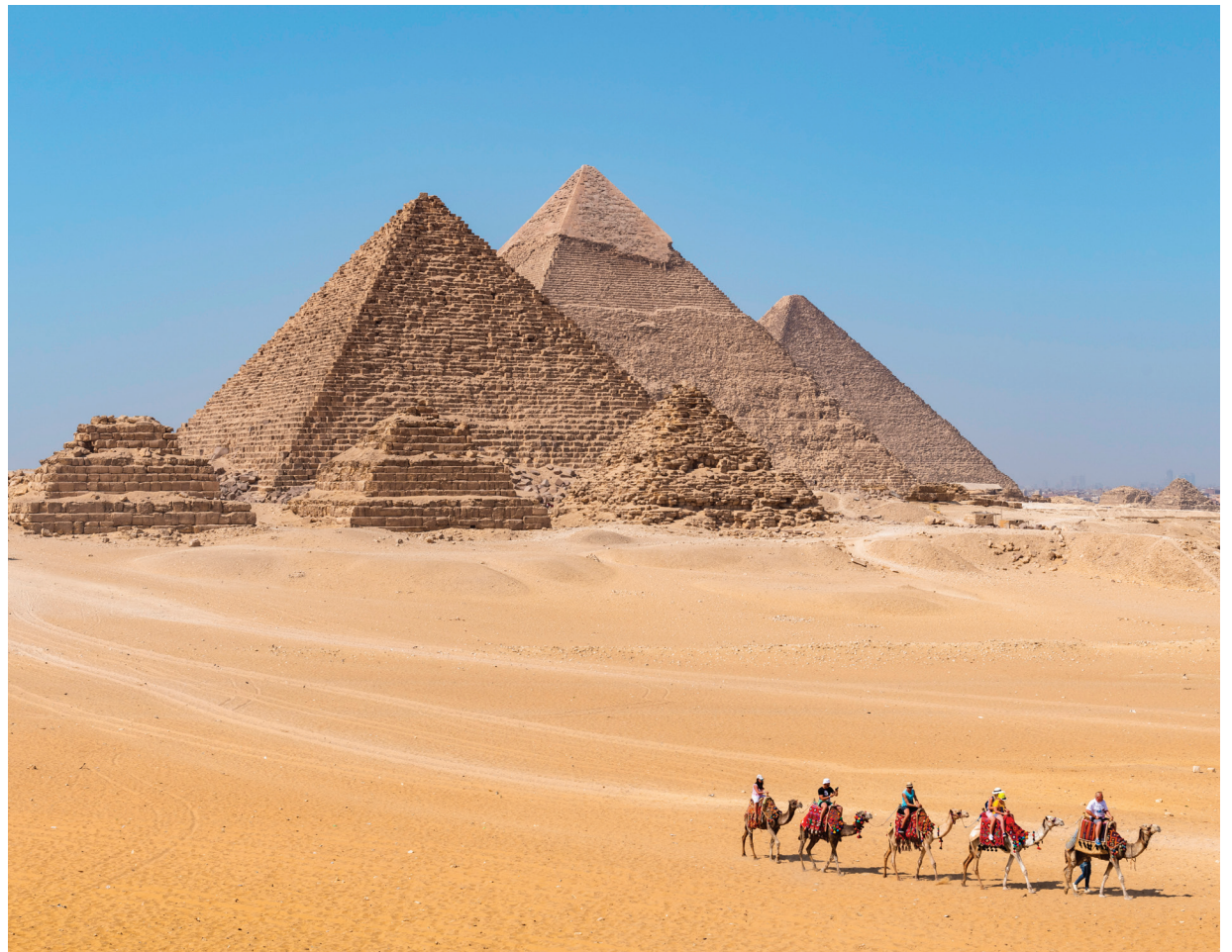
On Day 4 we travel to the Giza plateau to see the legendary pyramids, built 5,000 years ago as royal tombs.

Ratings are based on the Hotel & Travel Index, the travel industry standard reference.