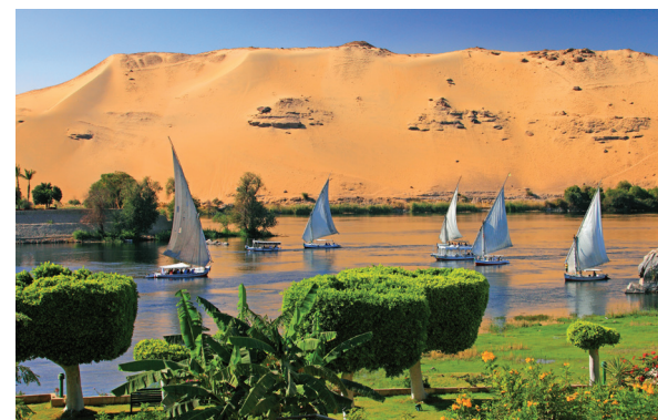
We sail traditional feluccas along the Nile.

Day 13: Luxor/Cairo We fly to Cairo today. Upon arrival, we visit the lively Khan el-Khalili bazaar. We then visit Citadel of Saladin, a spectacular medieval fortress set high on a hill with extraordinary views of the city below. After time for lunch on our own, we check into our hotel and have the remainder of the day free to spend as we wish. B