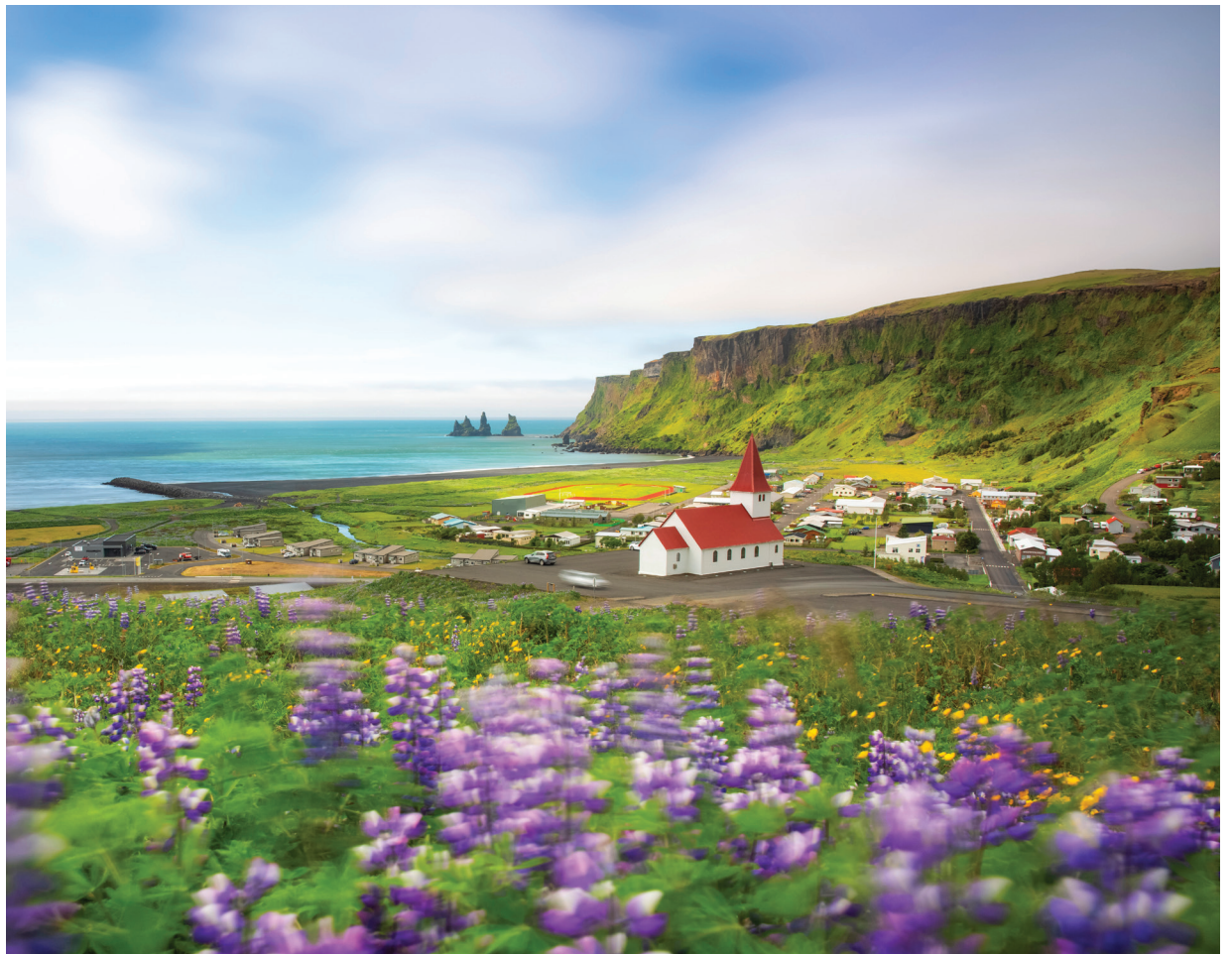
We spend days exploring the scenic Icelandic countryside.