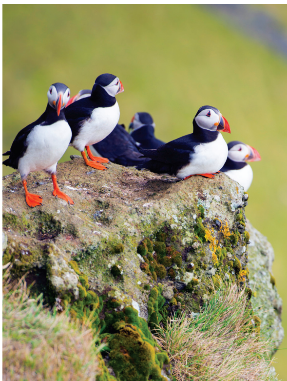
We may see puffins on our tour.

Day 7: Siglufjordur/Husafell We travel towards the southwest corner of Iceland today, passing through more incredible natural scenery. En route, we visit Glaumbaer, a folk museum featuring authentic turf houses. Later we stop at a local farm featuring famed Icelandic horses – small, hardy, and with long manes. We also enjoy scenic views at Grabrok Crater, and stop to view the thermal areas of Deildartunguhver and Hraunfossar Falls. B,D