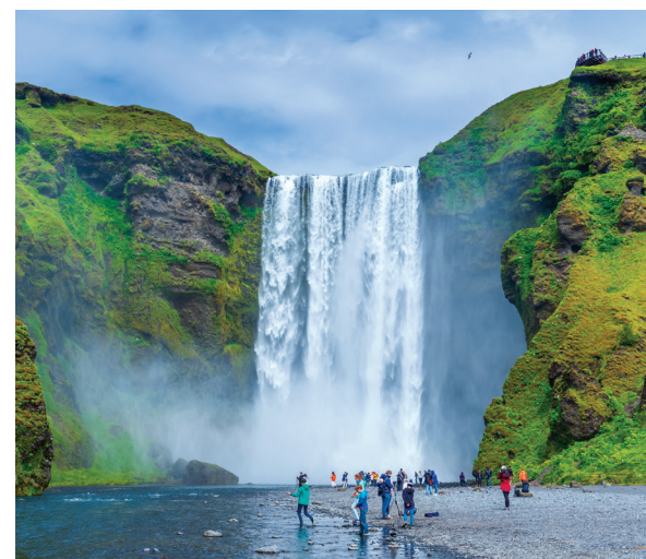
We visit popular Skogafoss on Day 3.