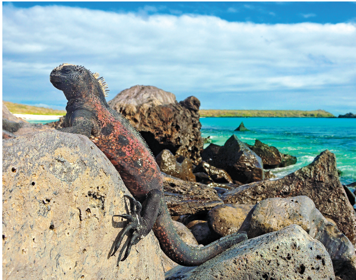
We'll encounter plenty of wildlife in the Galapagos, including relatives of this marine iguana.