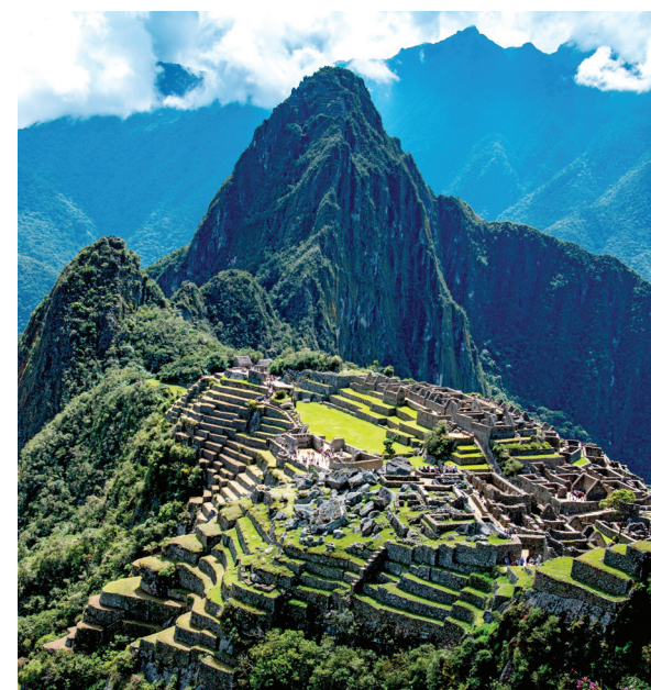
We explore the amazing ruins at Machu Picchu on Days 5 & 6.

Day 16: Quito/Depart for U.S. This morning we visit Quito's Botanical Gardens, featuring an orchidarium with more than 1,200 species of orchids and Iñaquito Market. Then we return to our hotel for an afternoon at leisure before tonight's transfer to the airport for our overnight flight to the U.S. B