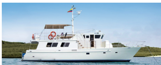
We stay in comfort for four nights in spacious rooms at the Royal Palm Galapagos, set in the lush highlands of Santa Cruz island, and enjoy day cruises aboard the Santa Fe, our privately chartered yacht.