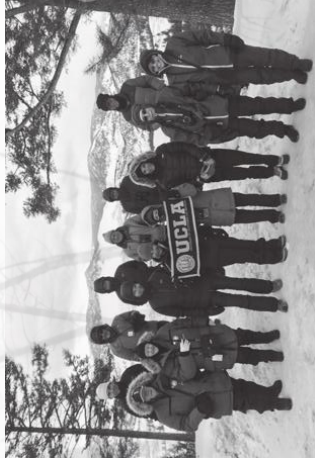
UCLA alumni on a previous Orbridge Wolves and Wildlife of Yellowstone travel program.