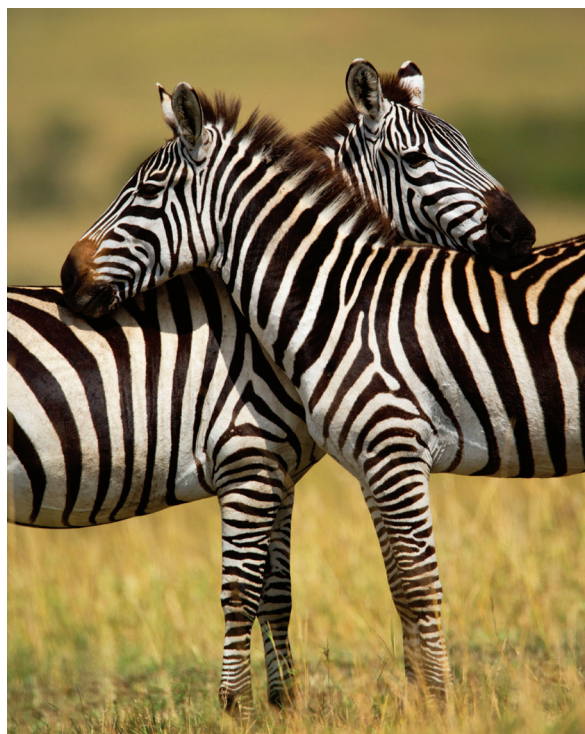
We're sure to see zebra.

Day 16: Arrive U.S. We reach the U.S. today and connect with our flights home.