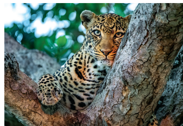
Leopard in the Serengeti